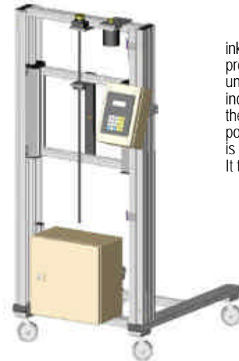
Shown with operator interface

The Hadley Smart Stands allow label applicators and inkjets to be positioned automatically based on the selected product. With a couple of screen selections the coding units will move to their pre-assigned positions. Even the individual applicator product sensors when mounted to the Hadley Vertical Carton Feeder move to their assigned positions! We are very excited to offer this product which is an exclusive to the Hadley labeling equipment family. It truly fulfills the expression "Just Load and Code"!