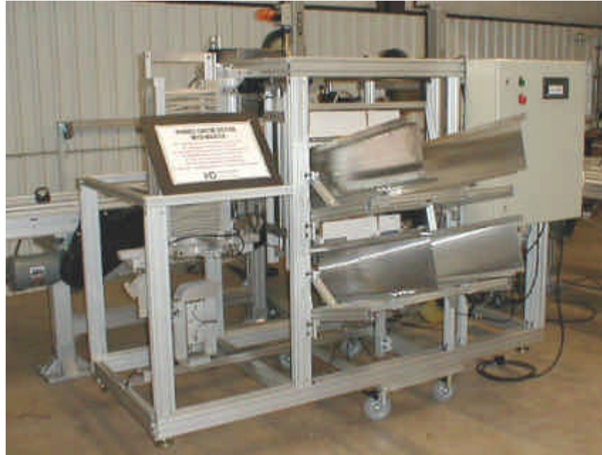
Shown prior to being placed into service